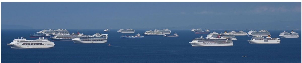
Fig. 2 Cruise ships aggregated at anchor at Manila Bay, Philippines (May 31, 2020), in response to COVID-19 disruptions and restrictions.

45 days before and after. Port brightness is proportional to number of visits during this period (totals: 346,501 separate port callings, 3889 unique ports and anchorages, 6693 unique vessels). Data provided by S & P Global